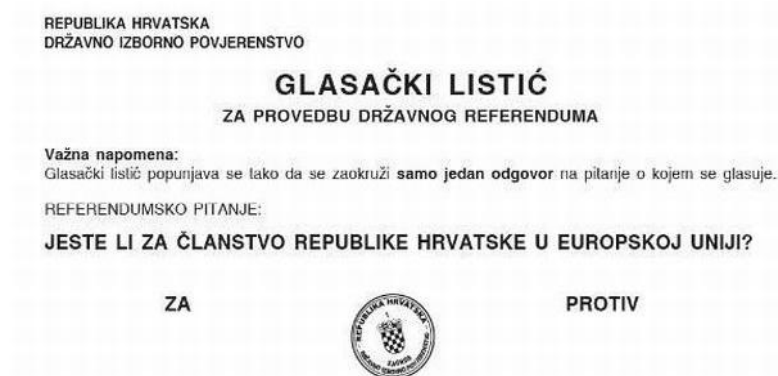
Figure 3: Croatian European Union Membership Referendum Ballot 2012.

Croatia is supposed to join the EU in 2013 as second Balkan state after Slovenia, as soon as all EU member states have ratified its accession treaty, as negotiated by the Croatian government between 2005 and 2011. The treaty was signed on the margins of the 9 December 2011 European Council. However, before accession could take place, a referendum was constitutionally prescribed by Art. 142 of the Constitution because some constitutional provisions had to be amended. It thus remained a constitutional obligation for Croatia to hold a referendum. 22 Moreover -current- Art. 149 prescribes that the decision to amend the Constitution shall be made by a two-thirds majority of MPs. The also newly elected parliament called on 23 December 2011 for a referendum to take place on 22 January 2012. It defined the referendum question as: “Are you in favour of the Republic of Croatia’s European Union membership?” Two-third of the voters approved membership, while the turnout was 43% (Čović, 2012, pp.5-6).